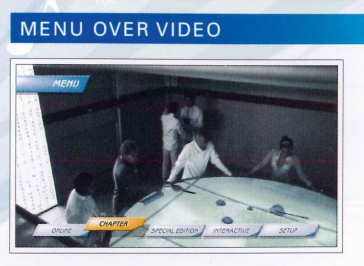
While watching the movie, you can search the menu and make changes to set-up options or access other functions.

HD DVD is capable of offering unique interactive features that are intended to deliver a superior entertainment experience.* From a single disc, many new levels of interactivity are possible. Some possibilities include: